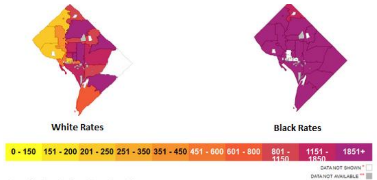
Rates of Black & White Persons Living with an HIV Diagnosis, by County, Washington, DC, 2015