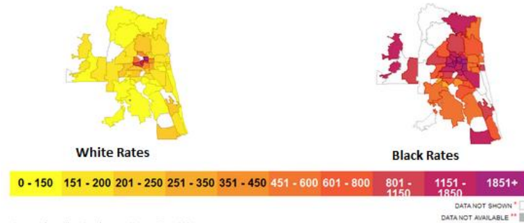
Rates of Black & White Persons Living with an HIV Diagnosis, by County, Jacksonville, FL, 2015